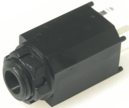
S1V/SSB without chassis ground