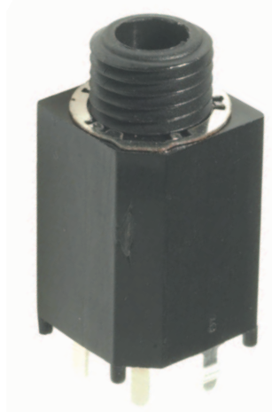
S1VX/SBB with chassis ground

The CLIFF ® range of S1V Jack Sockets incorporate significant new design features. The compact design offers the highest board packing density available. The design supports auto insertion and snap-in PCB mounting to facilitate assembly and wave soldering. The S1V is available with optional chassis grounding, a choice of either a plastic or metal nose, different fixing nut options and six circuit options.